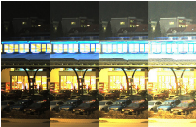
Figure 1 Four extracts of the same night image, which was taken in the evening out of the lab towards a supermarket in Kelheim with a pco.edge 5.5 color sCMOS camera system. The difference between each column is the way how the 16 bit image was scaled to the 8 bit world of the print or the screen, but all versions have been created of the same raw data file. The first column on the left side shows a full scale conversion (value 65536 (16 bit max) -> value 256 (8 bit max) and value 0 (16 bit) -> value 0 (8 bit)), while the column on the right shows a low scale conversion (value 1024 (16 bit low) -> value 256 (8 bit max) and value 0 (16 bit) -> value 0 (8 bit)). The other columns show different conversions in between.

What is the benefit of a large dynamic or dynamic range of an image sensor or a camera system? All displays and TV screens are in 8 bit dynamic, because the un-trained eye is only able to distinguish appr. 256 light levels. Radiologists are trained to see more, therefore their screens go up to 10 bit. The general perception could be that people might say 8 bit is far good enough. This is further supported by the fact that nowadays people are very happy with the 8 or 6 bit dynamic range of their smartphone cameras because they deliver nice and colorful pictures, so the question remains, what is the advantage of a large dynamic range?